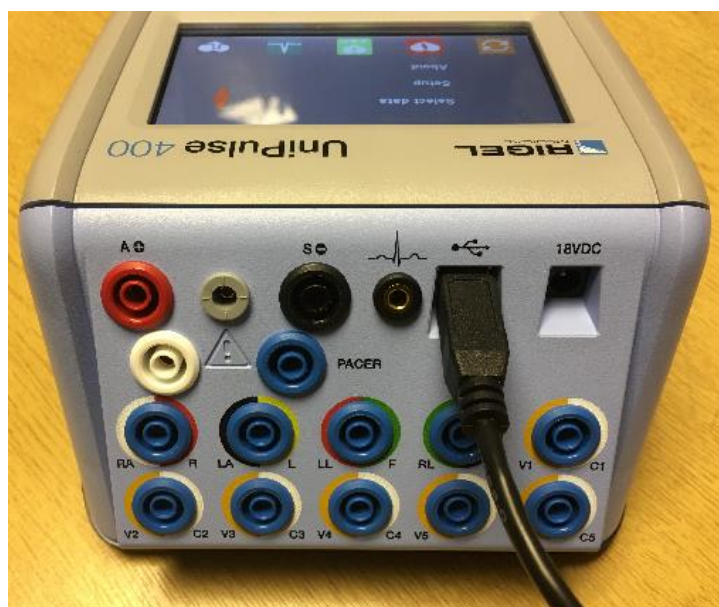
Figure 1 Back Plate USB Connection